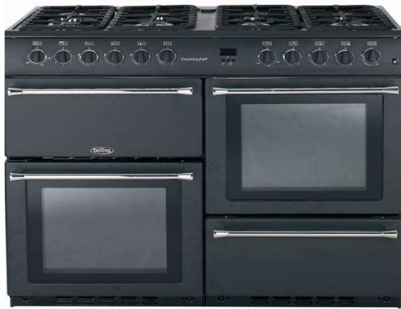
Belling Country Chef 100G Anthracite(444445946) & Silver(444445945)