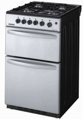
New World Vision 50TWLM Silver(444445698) & White(444445697) New World Vision 50WLM Silver(444445020) & White(444445021)