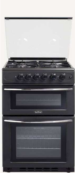
Belling G755 White(50531081) & Anthracite(50531082) Belling GT755 White(444449050)